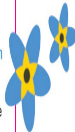
Singing for Fun

There will be a volunteer ambassador there to answer any questions.